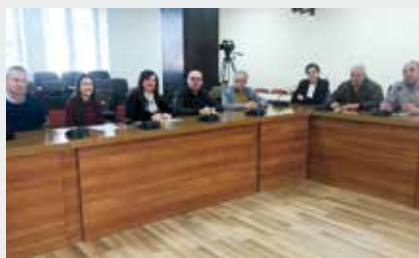
Stakeholder Working Group meeting, North Macedonia