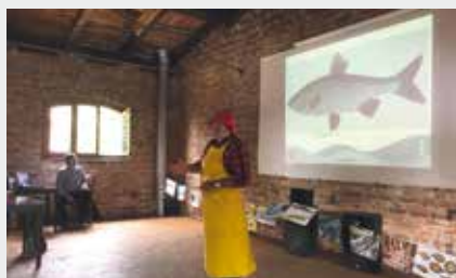
Seminar on circular bioeconomy potential, Poland