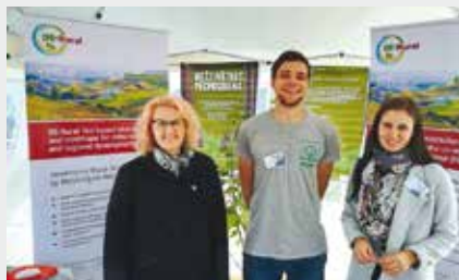
Educational Event, Latvia