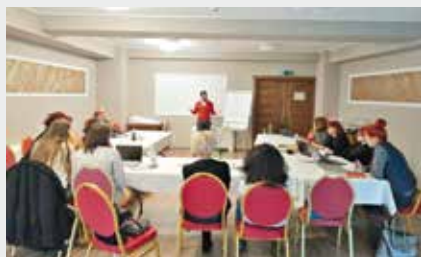
Regional Cluster Workshop, Romania