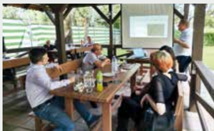
Knowledge Exchange and Capacity Building, Romania