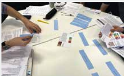
Educational material workshop, UK