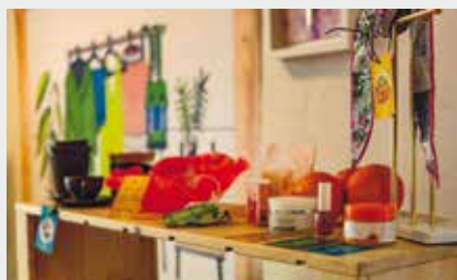
Pop-Up Store, Latvia