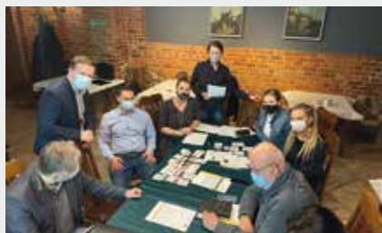
Educational Event, Poland