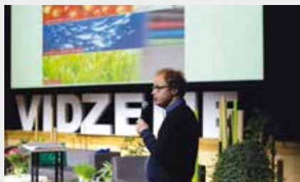
BE-Rural presentation at Vidzeme Innovation Week, Latvia