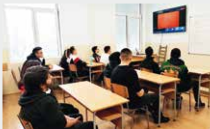
Educational Event, Bulgaria