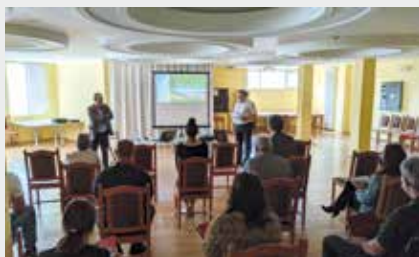
Capacity Building and Knowledge Exchange seminar, Bulgaria