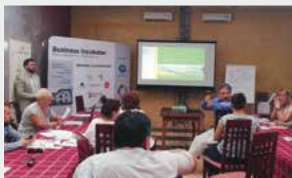
Knowledge Exchange and Capacity Building seminar, Romania