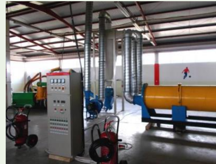
Producing and packaging biofuel (PELLET) from olive harvesting residues in Greece