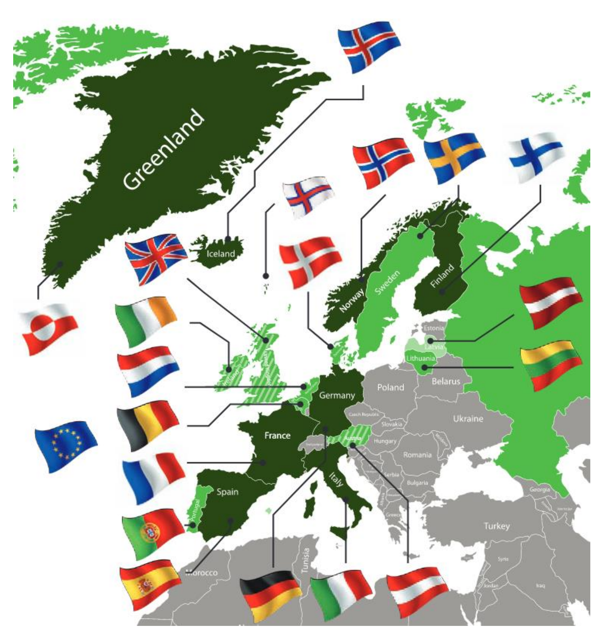
Figure 1: Bioeconomy Policies in Europe (dark green: dedicated bioeconomy strategy; green: bioeconomy-related strategy; green-striped: bioeconomy-related strategy, dedicated bioeconomy strategy is under development; light green: dedicated bioeconomy strategy is under development) (changed according to von Braun 2017)

The concept foresees to introduce healthy, safe and nutritious food and feed , to provide new chemicals , building-blocks and polymers as well as bioenergy and biofuels replacing fossil energy, to develop new, more efficient and sustainable practices and technologies , and to deliver solutions for green and sustainable chemistry. Thereby, the bioeconomy contributes to mitigating climate change , provides an important renewable carbon source and brings new business opportunities , investment and employment to rural, coastal and marine areas, fosters regional development and supports SMEs.